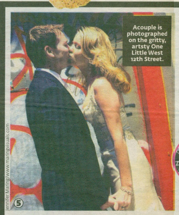
A couple is photographed on the gritty, artsy One Little West 12th Street.

"It's an incredible one-stop shop offering a dazzling combination of china and jewelry that will impress even the pickiest of brides and grooms."