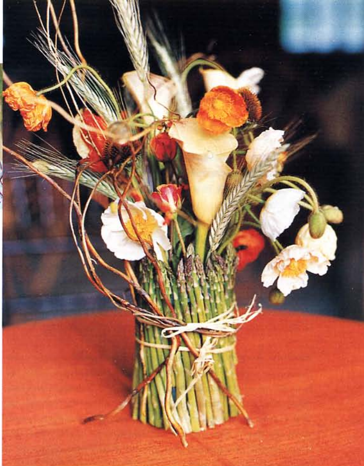
OPPOSITE: Tutera designed this October wedding, held at a private home in Texas. THIS PAGE, CLOCKWISE FROM TOP LEFT: The designer; for the floral centerpieces, asparagus stalks were tied around glass vases with raffia; sprigs of wheat were tucked into each napkin; a carrot cake with fondant leaf and flower decorations; on the escort card table, an invitation was set on a bed of wheat against a moss-covered urn.

Harvest Feast "For the first course, consider offering small portions of three soups—tomato, pumpkin and potato are perfect for fall—served in hollowed-out gourds. Creamy risotto is also a good choice. For the main course, opt for hearty entrées like beef tenderloin or filet